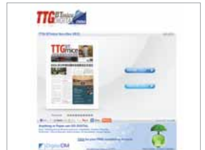
TTG-BTmice China DIGITAL Landing Page