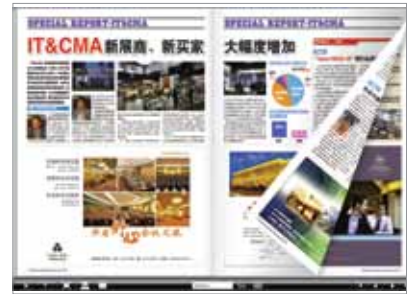
TTG -BTmice China DIGITAL