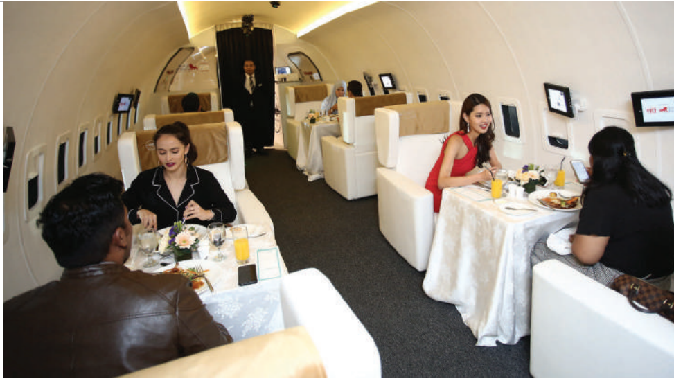
Above: Plane in the City experience in Kuala Lumpur, Malaysia

Adventure director, Exo Travel ADVENTURE One of the recent trends we have been seeing is a growing demand for family adventures in Thailand, especially in Mae Wang district, central Chiang Mai. Whether it's deep in nature such as cooking a delicious meal in the jungle, or cultural interactions in homestays, there