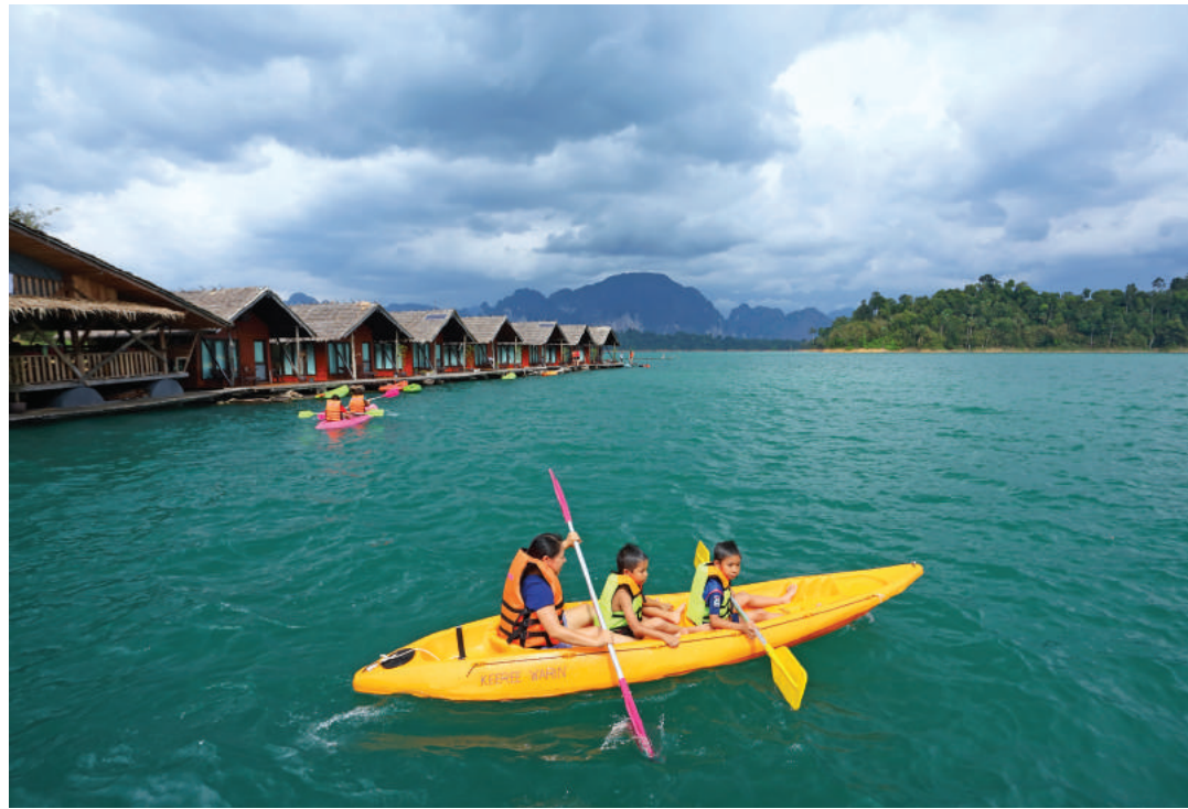
Above: Canoeing on Cheow Lan Lake in Khao Sok National Park, Thailand

ADVENTURE Kedah in (Peninsular Malaysia's) north-west is a new adventure destination thanks to improved air links as well as the upgraded facilities at Langkawi airport. Among Kedah's offerings we are promoting to adrenaline junkies and millennials is paragliding on Mount Jerai. It offers scenic views of paddy fields, and a birds'-eye view of the Straits of Melaka and its offshore islands.