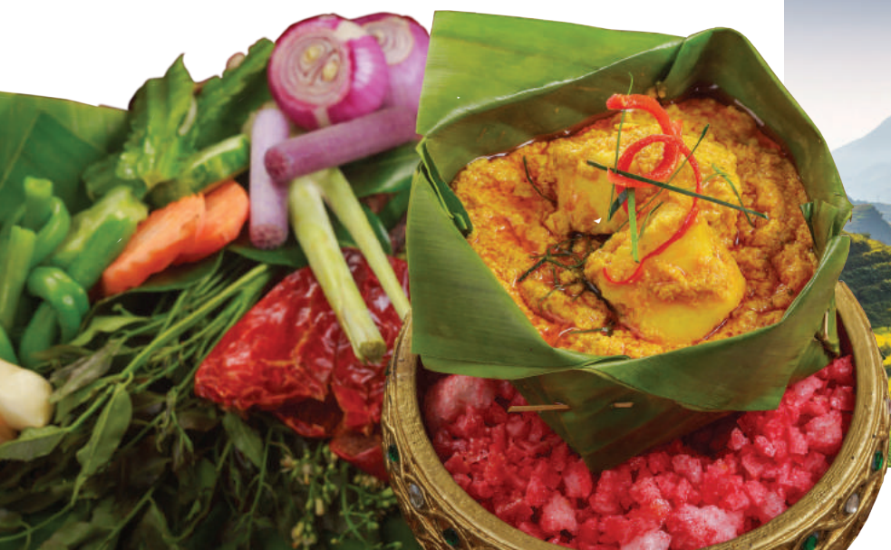
Below, from left: A traditional Cambodian dish called fish amok; terraced rice fields in Muong Hoa Valley in Sapa, Vietnam

CULINARY Cooking classes, food tastings and discovering the flavours of tribal food in Kachin, Wa, Shan and Rakhine. The first episode of Myanmar Masterchef was a huge